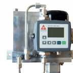
CJC™ Oil Contamination Monitor, OCM15 Continuous online particle and moisture monitoring can be installed as an option

ООО «ТИ-СИСТЕМС» ИНЖИНИРИНГ И ПОСТАВКА ТЕХНОЛОГИЧЕСКОГО ОБОРУДОВАНИЯ