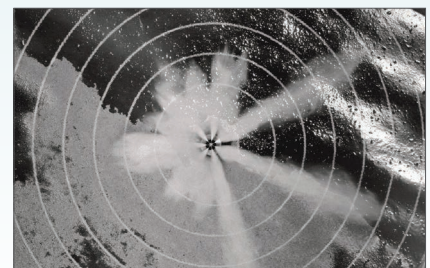
Poor injector spray pattern, from worn injector (photo taken with a microscope at nozzle point)

While the HPCR has become a standard, the diesel cleanliness requirements for these systems have not yet become industry standards, which has an impact on wear and tear. While most OEMs recommend a diesel cleanliness of ISO 18/16/13, the reality is that ISO 14/12/9 or even lower is needed to provide the expected component lifetime. In a HPCR system operating under 2,000 - 3,000 bar pressure and needle valves with a clearance of 2-4 microns, the difference between ISO code 18/16/13 and 14/12/9 translates into several thousand extra operating hours on injectors and fuel pumps. The high pressure through the injectors creates "blasting" with water droplets and particles; and it causes water implosions (cavitation) resulting in high wear rates on injectors. Furthermore, particles will generate wear on the entire injector system and lead to poor spray patterns. This results in incomplete combustions and reduced engine component and oil lifetime. This is exacerbated by rust and corrosion. Today it has become common to see as low as 2,000 hours lifetime of injectors and frequent fuel pump failures, where industry standard should in fact be significantly higher. Recommended injector lifetime of most engines is 9,000 hours. With ultra clean diesel fuel this can in fact be extended even longer.