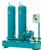
CJC™ Diesel Filter HDU 2x27-108 GP