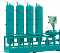
CJC™ Diesel Filter PTU3 4x27/108 GP